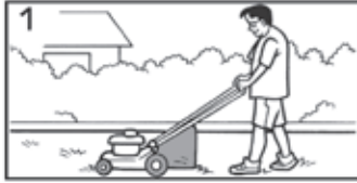
Sean is cutting the grass.

cut the grass water the flowers plant seeds pick strawberries feed the birds make a window box eat a carrot dig a hole